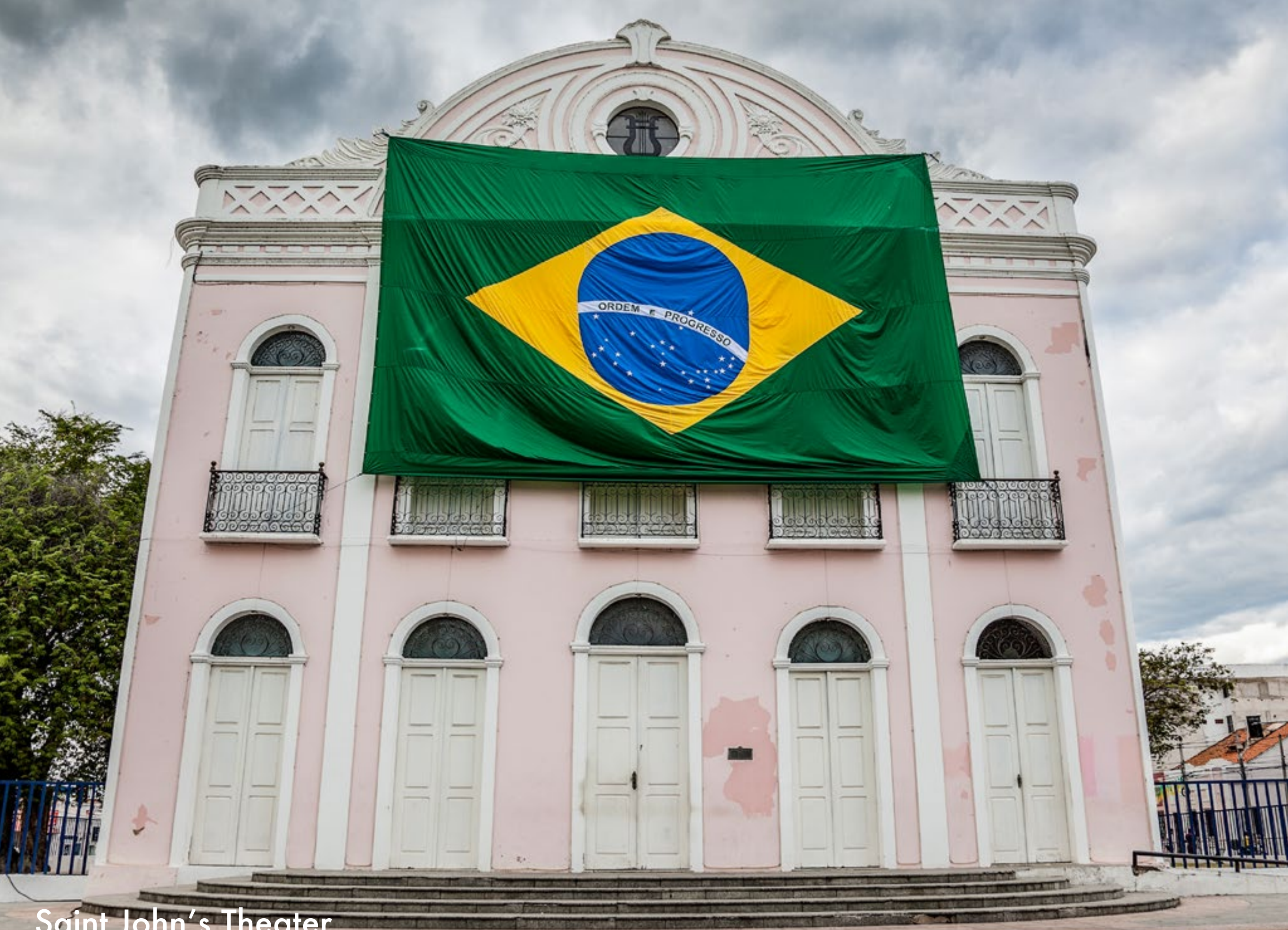
Saint John's Theater