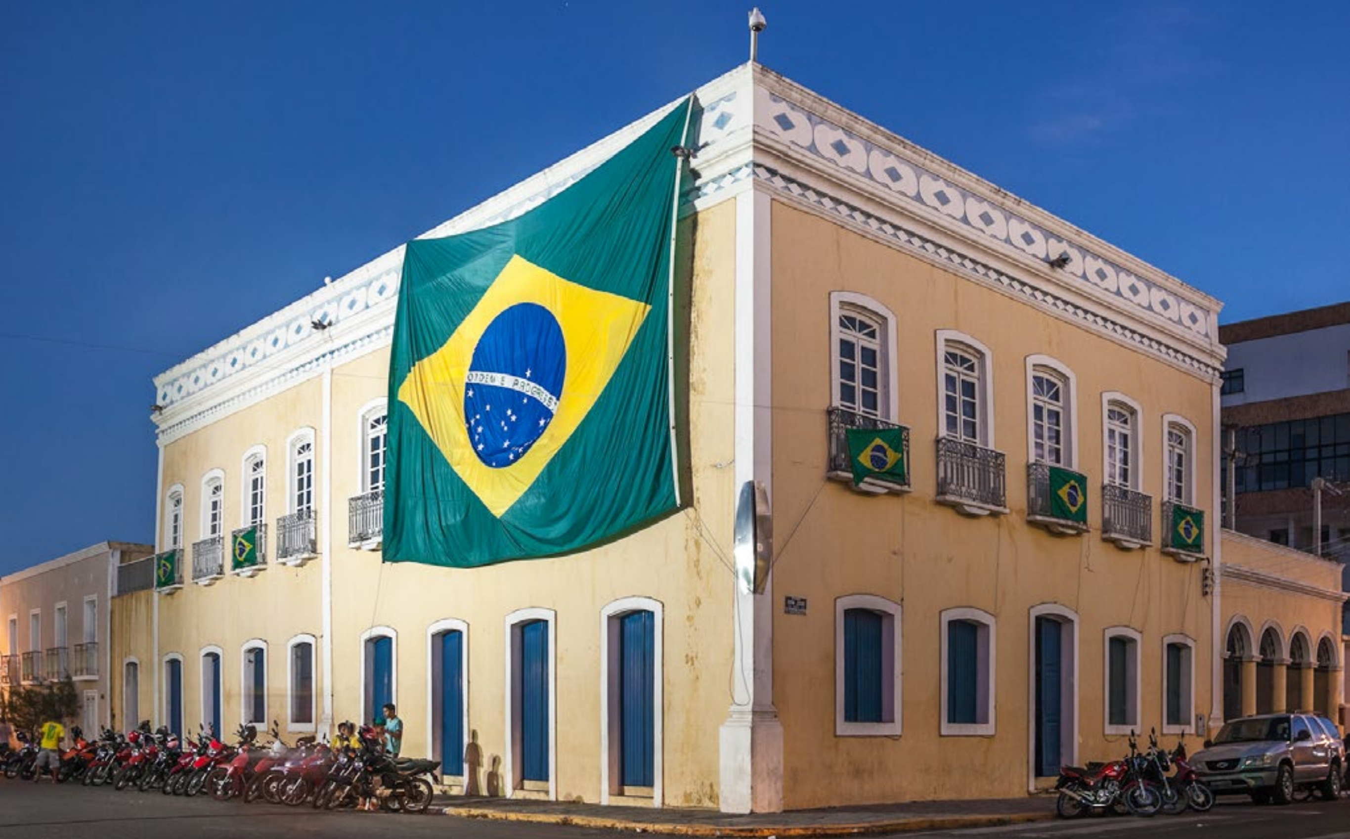
House of Culture