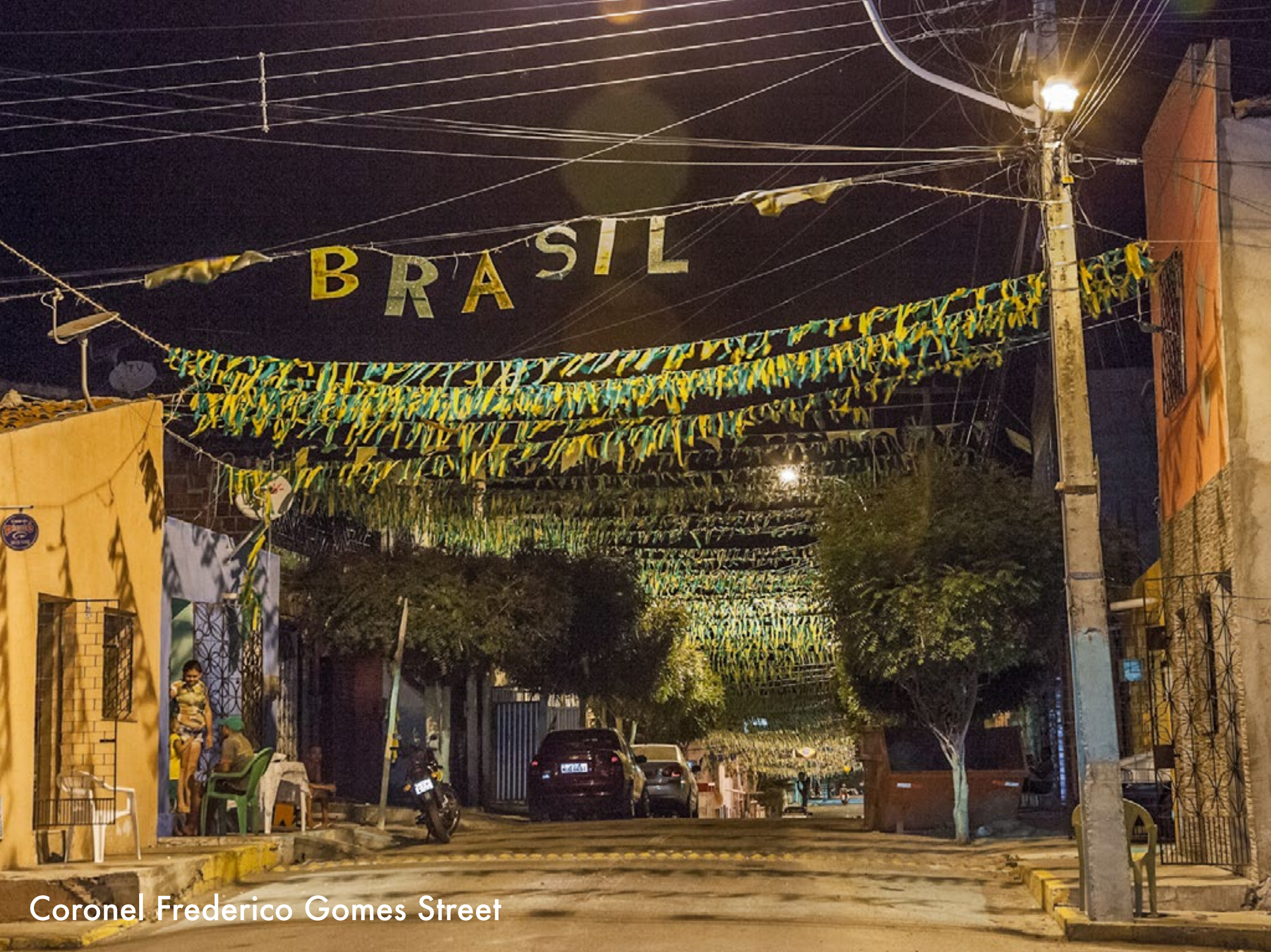
Coronel Frederico Gomes Street