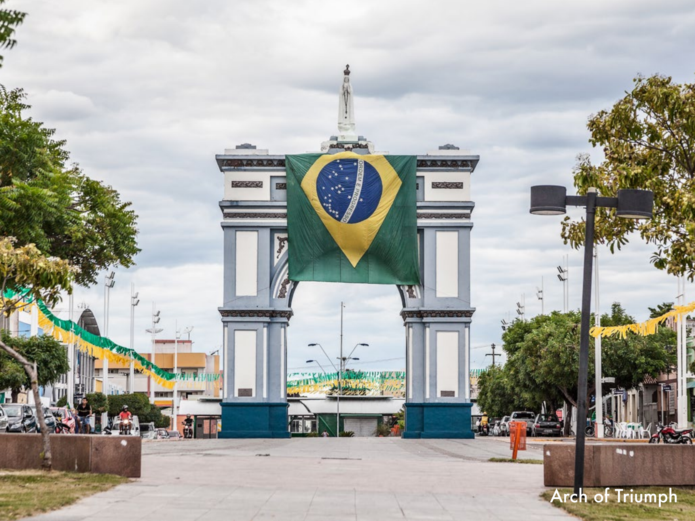
Arch of Triumph