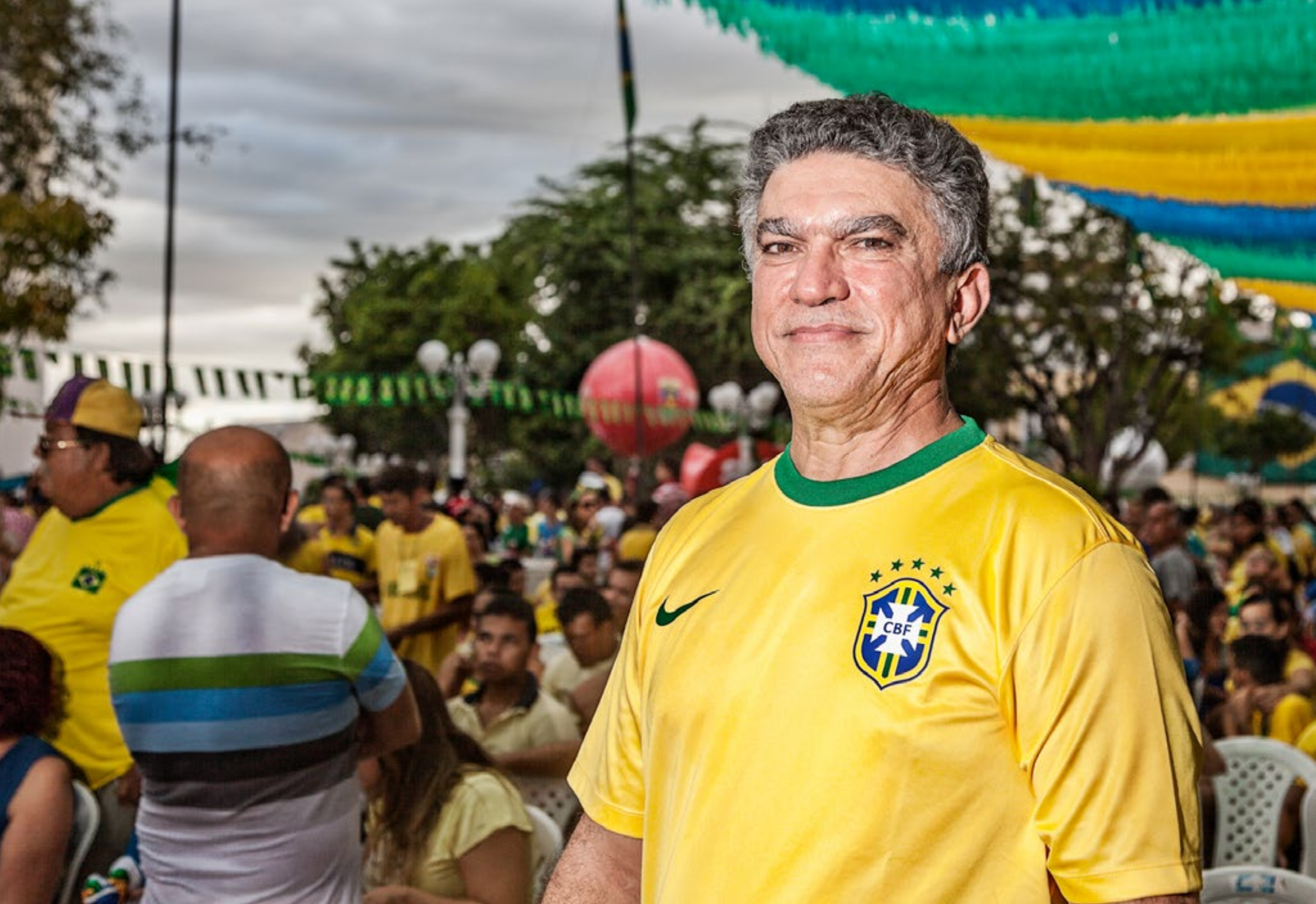
José Clodoveu de Arruda Neto - Mayor of Sobral